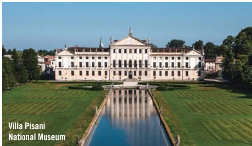
Villa Pisani National Museum

Closer to the Grand Canal, the VILLA PISANI NATIONAL MUSEUM sits 20 minutes outside of Venice, in Stra. Situated along the Riviera del Brenta, Villa Pisani boasts innumerable art treasures among its 144 rooms, the centerpiece of which—the ballroom—features The Glory of the Pisani Family , a fresco by Giambattista Tiepolo, 18th-century Italy’s greatest painter, on its ceiling. villapisani.beniculturali.it