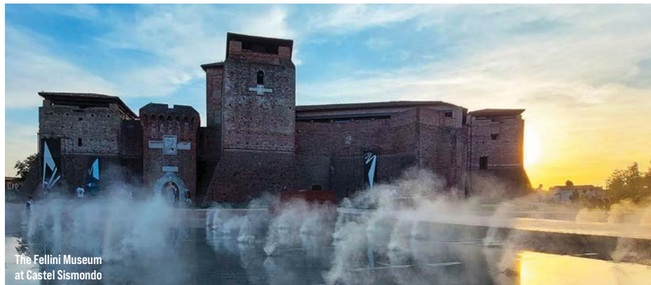
The Fellini Museum at Castel Sismondo