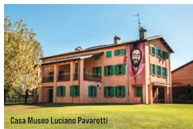
Casa Museo Luciano Pavarotti

away, the Palazzo houses the Fulgor cinema, memorialized in Fellini's Amarcord . In between lies the Piazza, which combines areas for art installations and performances with spots for reflection and rest. fellinimuseum.it/en